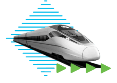
40% Faster performance on Microsoft 365<sup>2</sup>