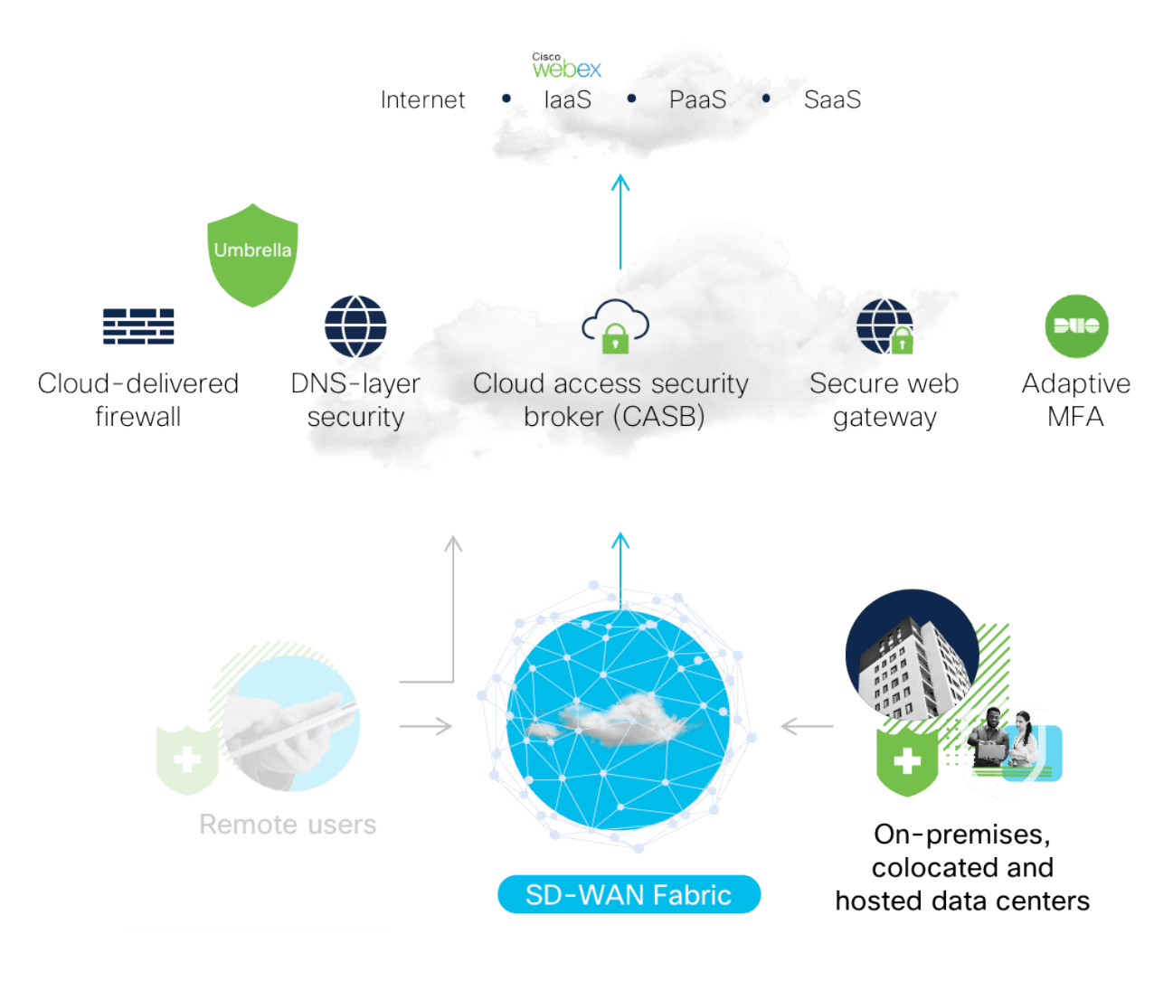
Figure 3: Cisco SD-WAN enabled branch architecture.

Automate deployment of cloud security across your SD-WAN fabric to thousands of branches and instantly begin protecting against threats. Secure and connect users over any transport to any cloud with a simple and intuitive onboarding to SASE.Cisco SD-WAN delivers automated tunneling through one-click, fullmesh VPN between all branch locations so you can scale up or down with ease. End-to-end security segmentation honors enterprise intent and provides branches with secure connectivity to everything they need: from onpremises and colocated facilities to integrated cloud services ranging from AWS to Azure, and more.