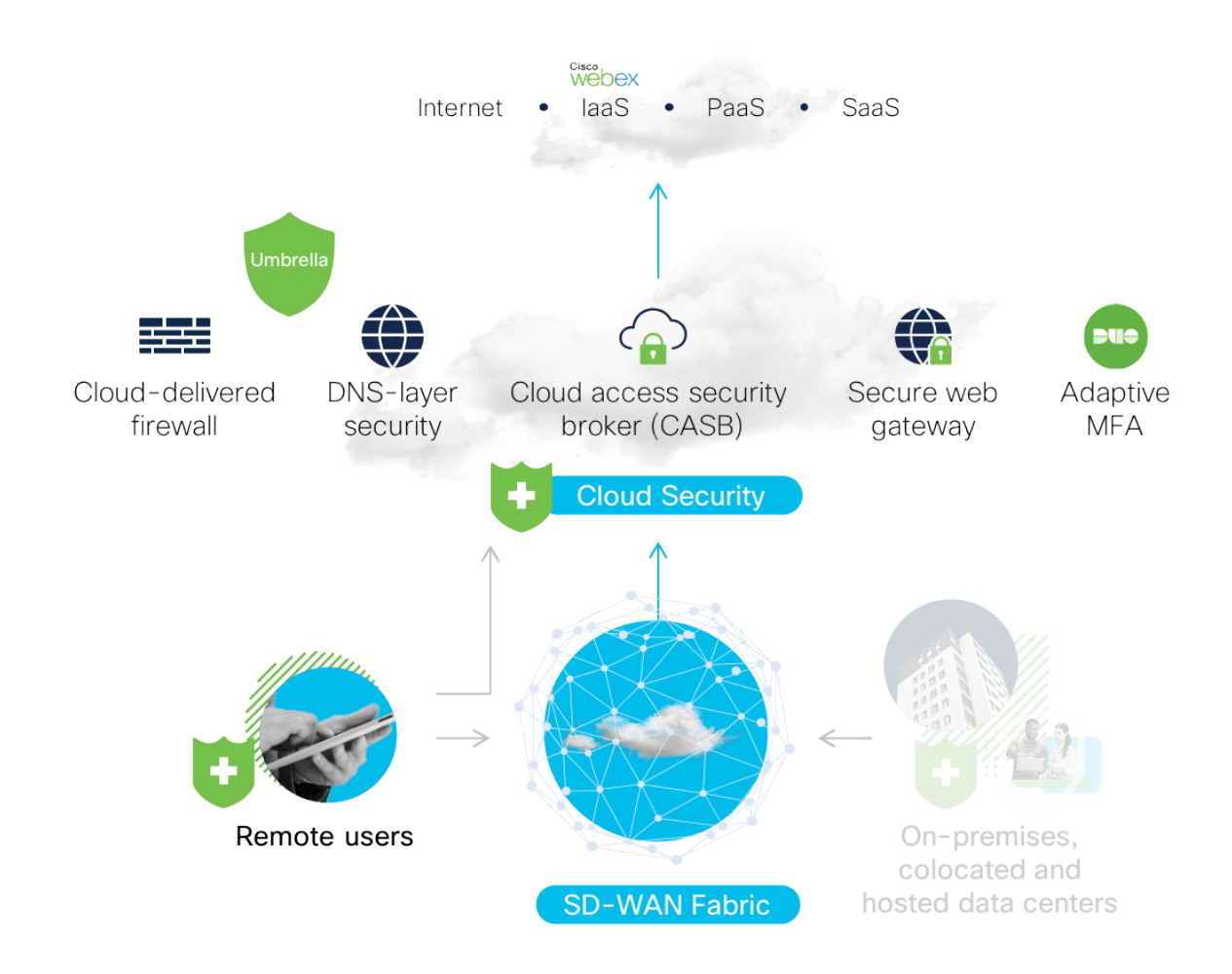
Figure 2: Cisco secure remote access architecture.

Umbrella provides secure connectivity in a single push with a single policy, all part of the most comprehensive cybersecurity platform in the industry.