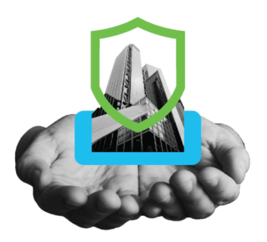
Converge networking and security functions in a more integrated fashion